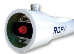
300 PSI Side port