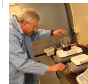
PILOTING AND APPLIED TESTING