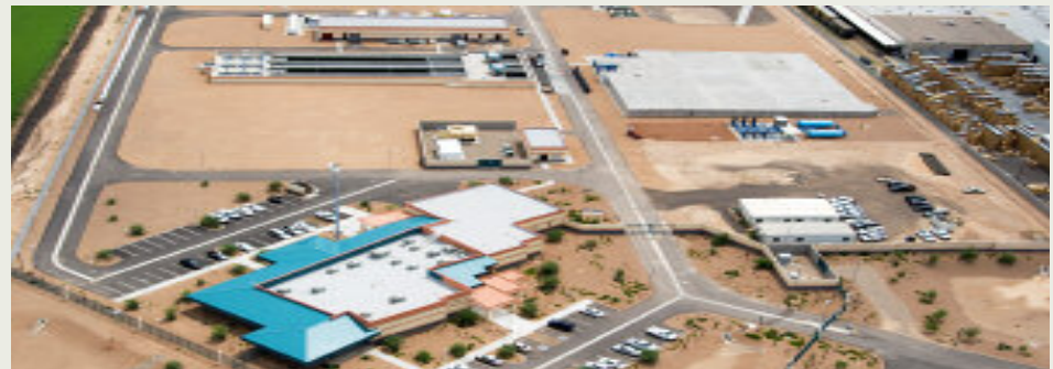
Glendale's water treatment plant

For Glendale, reactivation is not just an economic gain; it's an environmental plus as well. Through reactivation, spent carbon from the Glendale plants can be recycled for reuse, eliminating the costs and long-term liability associated with disposal. Not only does custom reactivation save rate payers money, but reactivating carbon produces only 20% of the CO 2 emissions required to manufacture virgin activated carbon. So, the carbon footprint is considerably reduced.